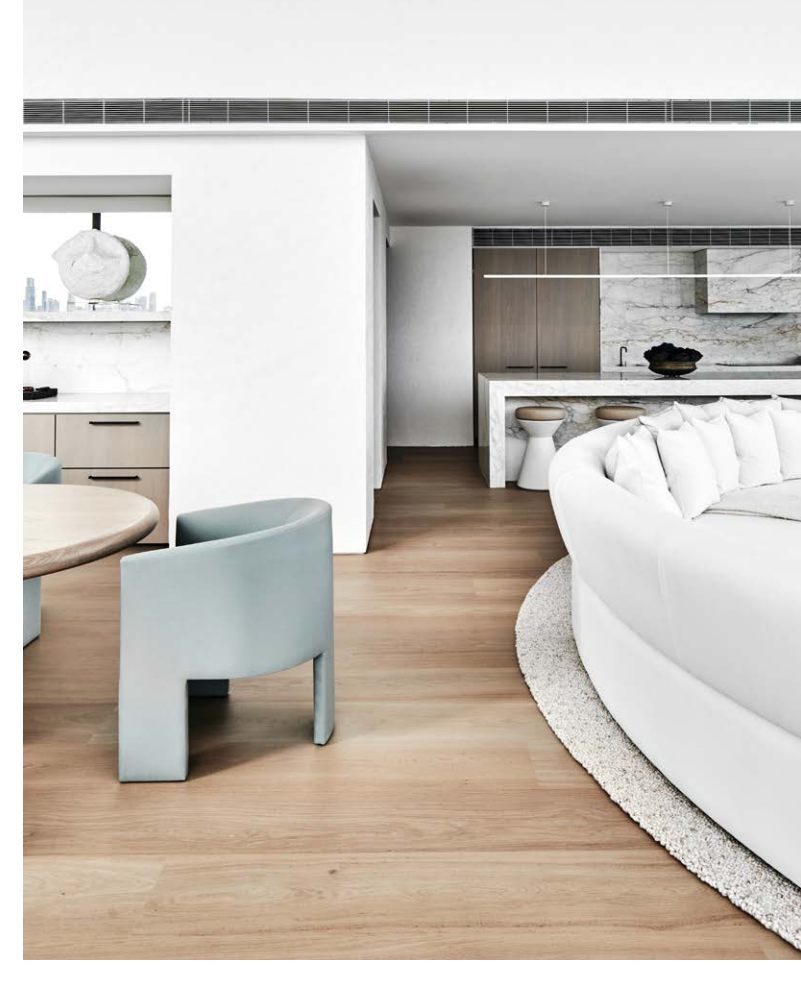
This page, from left In the kitchen, solid European oak floorboards in light-grey oil from Dinesen. Benchtop in Calacatta Paonazzo honed marble from G-Lux. Custom plaster stools with seat pad in Pavoni 'Veneto' leather from South Pacific Fabrics. Joinery in European oak veneer stained to match floorboards. 'Highline' pendant light in white from Archier. In the living and dining areas, custom sofa and dining chairs upholstered in Kravet outdoor fabric from Elliott Clarke. Opposite page Custom dining table in solid oak, stained to match floorboards, from In Good Company. Custom dining chairs upholstered in Kravet outdoor fabric from Elliott Clarke. 'Mushroom' pendant light by Stephen Antonson from Liz O'Brien, New York. Walls in custom Venetian plaster by Who Plastering.